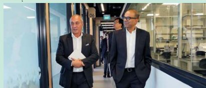
Guest of Honour Dr Janil Puthucherry, Senior Minister of State for Health, touring the co11ab facility.

biomedtech incubator. Officially unveiled on 22 August 2023, it aims to support start-ups and bridge the gap between groundbreaking research and successful commercial ventures.