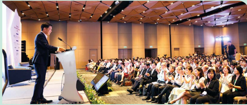
Mr Alvin Tan, Minister of State for the Ministry of Culture, Community and Youth, kicking off the conference with a plenary on fostering mental resilience in communities.

Conducted in a hybrid format, the conference was opened by Guest of Honour, Mr Ong Ye Kung, Minister for Health. Six plenary sessions and 40 presentations were organised for the approximately 800 attendees, and these included professionals from the government, healthcare, social, and education sectors, as well as patients and caregivers. Topics for discussion spanned youth mental health, workplace well-being, peer support, digital tools in mental healthcare, and the mental well-being of the elderly.