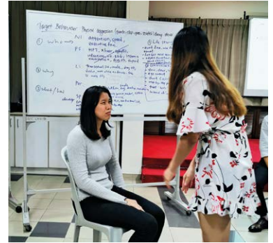
APCATS offers dementia care training to nursing home staff, combining didactic teaching with hands-on practice sessions, including role play.

As part of its Tier 2 work in the Tiered Care model, APCATS provides mental health training and consultancy to eldercare agencies, including active ageing centres,