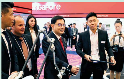
Guest of Honour, Deputy Prime Minister Mr Heng Swee Keat, touring the exhibition at RehabWeek 2023.

Various technologies were on show, including the Rehabilitation Digital Hub for tele-rehab services, the H-Man arm rehabilitation robot, and the Mobile