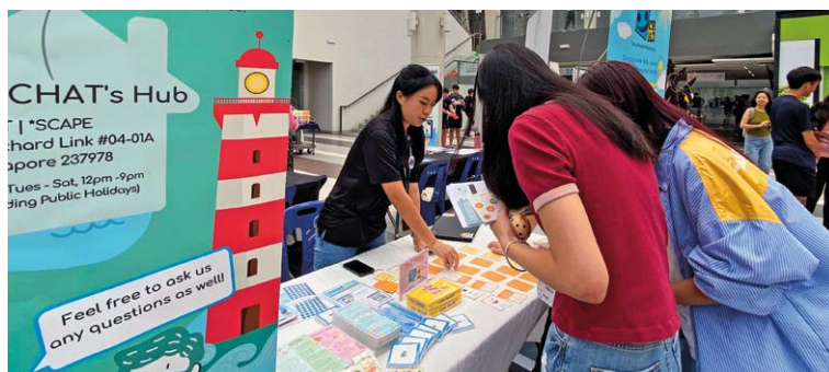
Outreach events organised by CHAT staff to raise awareness of its mental health services for youths.

Young people who prefer to remain anonymous can opt for webCHAT, which can be used to carry