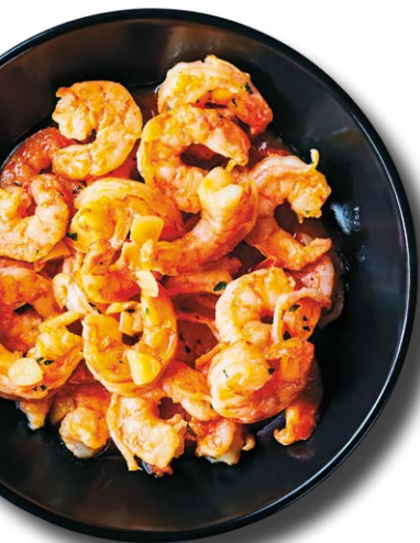
The food image is for illustrative purposes only and may not reflect the exact dish served at TTSH.

to create flavourful dishes. In such cases, we partner a dietitian who works with us to customise recipes for patients. It is a collaborative effort that seeks to combine taste and nutritional value for patients.