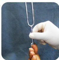
Tuning fork vibration testing (1)