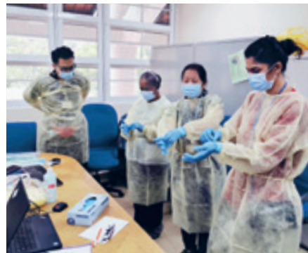
Clockwise from below: The Sayang Wellness Centre (SWC) Clinic at IMH; IMH Ward 82A and Ward 23A staff refresher training.