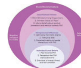
The socioecological explanatory model for stigma.

Nine focus group discussions were conducted between February and September 2018 with 63 Singaporean participants from the public. The study team identified 11 themes for the causes and reasons of stigma and conceptualised them into a sociological model to show how stigma was influenced by culture and environment. The generic causes of stigma such as the 'fear towards a person with mental illness (PMI)' and the 'intergroup bias' were universal and similar to what was reported in studies conducted overseas. The cultural influences of stigma identified in this study included the 'Chinese culture of 'face' and 'Asian's conservative values'. The themes that were more unique to Singapore's context were the 'elitist mindset among Singaporeans' and the 'perceived inability to handle interactions with PMI'. These findings would be helpful in shaping the design of future anti-stigma interventions in Singapore. The study was published in the BMC Psychiatry Journal in August 2020.