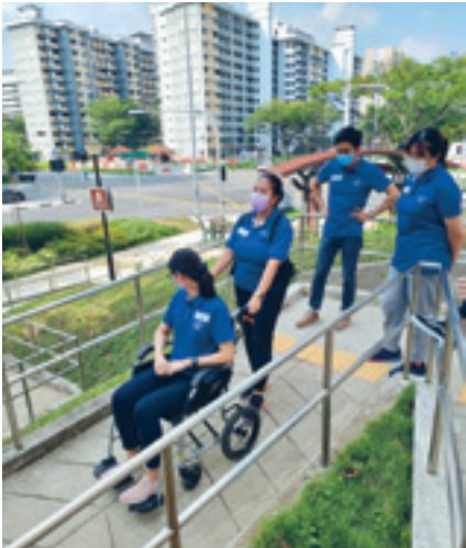
Carers being taught safe wheelchair handling techniques.