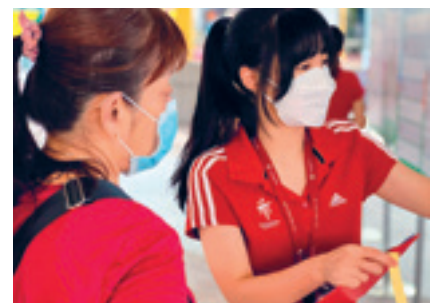
ABOVE AND LEFT Residents in Ang Mo Kio participating in a guerilla research session organised by TTSH's Centre for Health Activation and Kaizen Office.