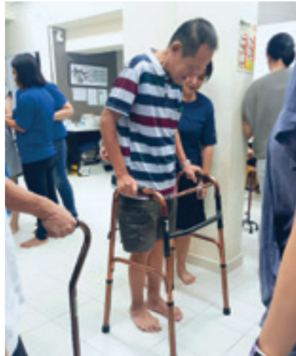
Carers experience how it feels like to use a walking aid.

at strengthening the community-enabling programmes, aligned with Healthier SG . Residents were invited to identify and discuss specific factors affecting community health and how the community could help shape the health of each person. The session also raised greater awareness and understanding among the local population on the correlation between individuals and the community in health and social care. The valuable insights gained from the residents helped improve TTSH's outreach programmes and co-created localised, community-driven solutions, making them more impactful, scalable, and sustainable in the community.