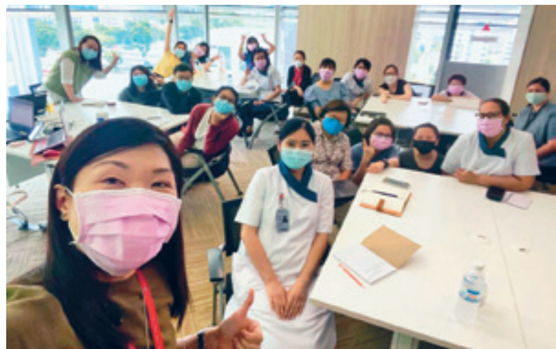
'What Matters to you' workshop.

Excellence (CAPE), the Psychology Department also conducted four workshops to train TTSH staff from various disciplines, including the Division of Central Health's Community Health Team, Allied Health, nursing, pharmacists, and medical teams, to incorporate 'What Matters' conversations into care encounters.