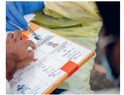
NHGP managed Forward Medical Posts in dormitories and cared for migrant workers.