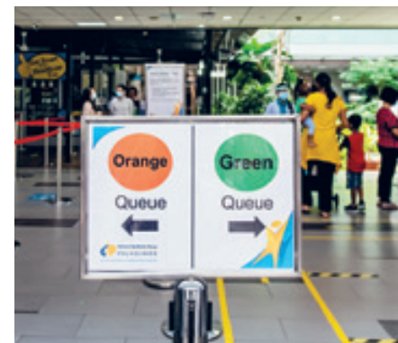
Patients were triaged and segregated into colour zones to minimise COVID-19 transmission risk.