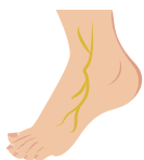
Ability to feel