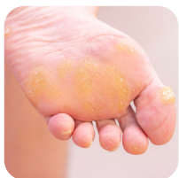
Callus with or without discolouration